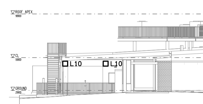
SOUTH EXTERNAL BUILDING ELEVATION SCALE 1:200